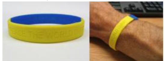
Rotary Wristbands - a symbol to show you care and a modern irresistible fashion accessory for young and young at heart

Rotary Wrist Bands - A symbol to show you care and an irresistible fashion accessory to those a little younger than ourselves. An initiative launched by the Rotary Club of Billericay D.1240, to raise funds for various projects to be run throughout this Rotary Year. The early success of the bands was brought to the attention of their DG Sandra Allen who promptly requested that they make them more widely available.