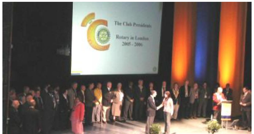
The Club Presidents are greeted on stage at our District Conference

This year's District Carol Service will be held at St Marylebone Parish Church, just across the road from York Gate on the evening of 7th December. Come and enjoy the carol singing and bring a gift, to bring some joy to a hospital bound young person. Mulled wine and mince pies at our HQ after the service.