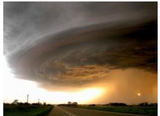
The awesome power and majesty of Hurricane Katrina

Rotary's objective of improving world peace and understanding and to enhancing the vocational experience and opportunities of those who go on these trips. Our District's selection process via the Clubs allows us to select those best suited to benefit from the programmes and to promote Rotary ideals during these unique experiences. Remember to invite scholars to talk at your Club and how about past exchange team members as potential Rotarians?